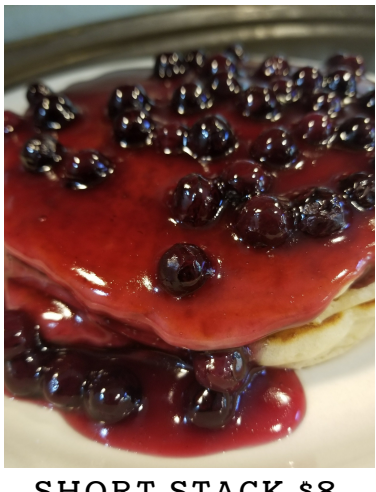
SHORT STACK $8

2 Pancakes Sprinkled with powdered sugar